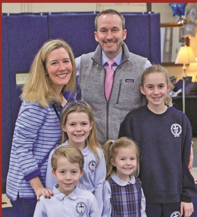
Special Person Luncheon