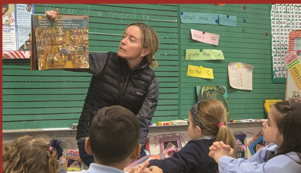
Parents often visit the classrooms as 'Mystery Readers' and to help with projects and holiday crafts