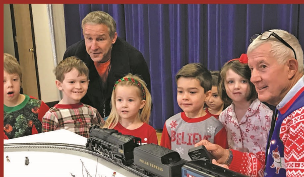
In preparation for the North Pole Express, grandfather and father show train set to students during "Pajama Day"

Family spirit is what makes Immaculate Conception School so special! Throughout the year, parents and children engage in numerous events and activities creating a caring and personal educational experience. Join our family!